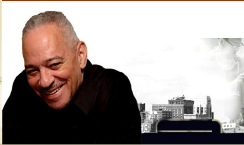
REV. Jeremiah A. Wright, Jr. D. MIN.

"...a fascinating history of a local church that has made an impact, not only on its city, but on the world."