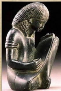
Amenhotep Son of Hapu